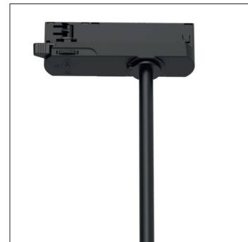
LP long mounting pipe 500 mm

All current index numbers, lumen outputs, power consumption and many other technical information are available in our 2024 pricelist. Details on wireless lighting control systems on page number 896.