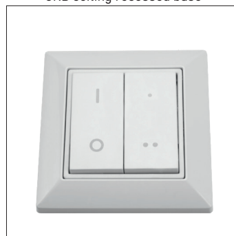
XCS wireless switch