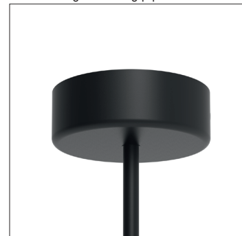
CMB ceiling mounting base