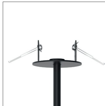
CRB ceiling recessed base